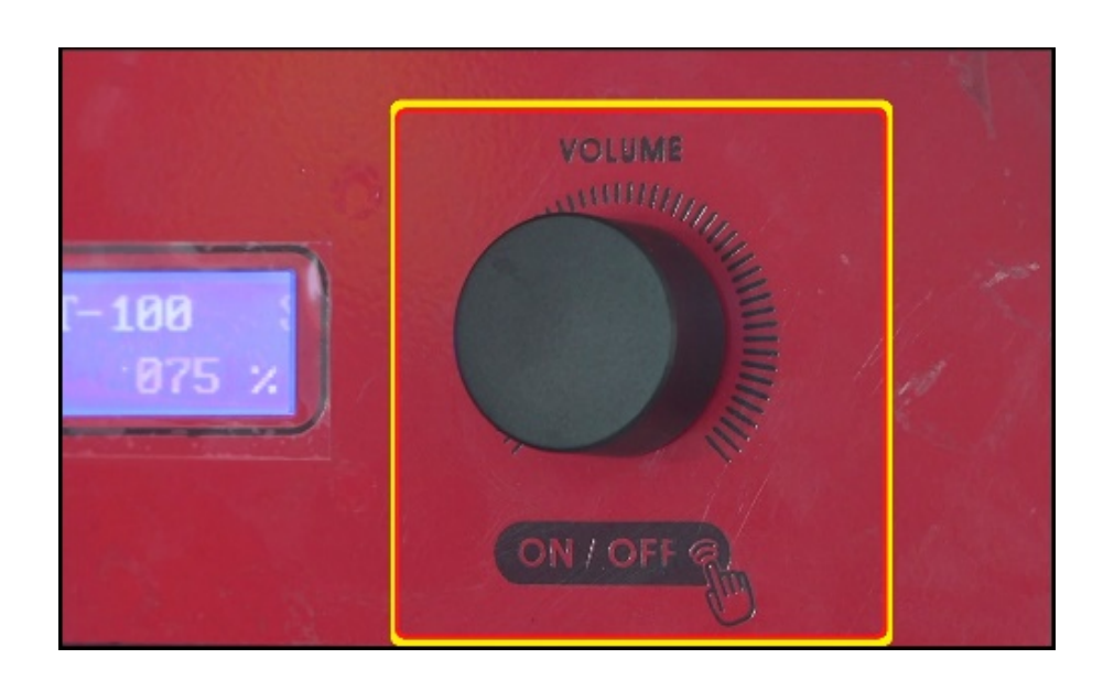
Step 6: To stop or pause the flow of fog, press the "VOLUME" rotary dial once. To resume the flow of fog, press the "TIMER" rotary dial once

STEP 5: Press the Timer button once to make fog come out, this will take up to 25 seconds, DO NOT TOUCH ANYTHING ELSE!!! Once fog starts, it will fog for 25 seconds and stop for 25 seconds. At this time it is warming back up and will start again.